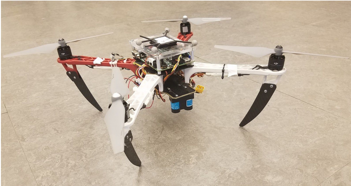
Figure 1-1: MicroCART quadcopter

Microprocessor Controlled Aerial Robotics Team or MicroCART project is centered around the development of a quadcopter (see Figure 1 below) and tracking system. This project has been in development since 1998 and the current system has been passed down since 2006. The project aims to create a stable and easy to use platform for researching control theory. The quadcopter flies primarily in the Distributed Sensing and Decision Making Laboratory within a twelve camera infrared tracking system.